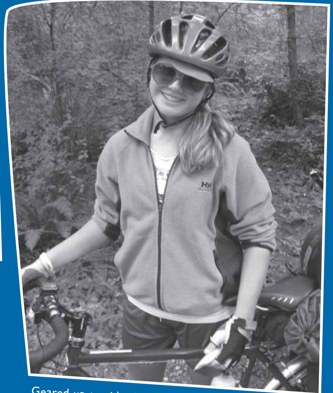
Geared up to ride through the woods with Bike Works.